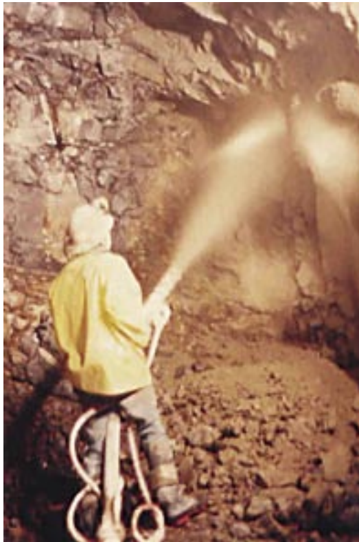
Tunnel construction provided a proving ground for new materials and equipment