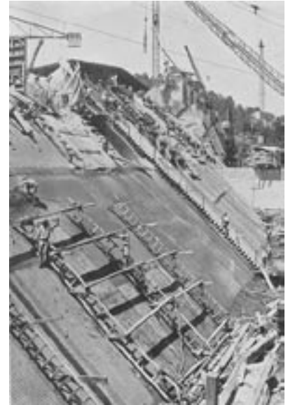
Gunite overlay for water proofing was done during construction of Chendorah Dam, Federated Malay States, c1930

We’ll assess the “recovery” in Part III.