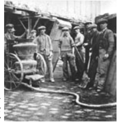
1920s Gunning Crew