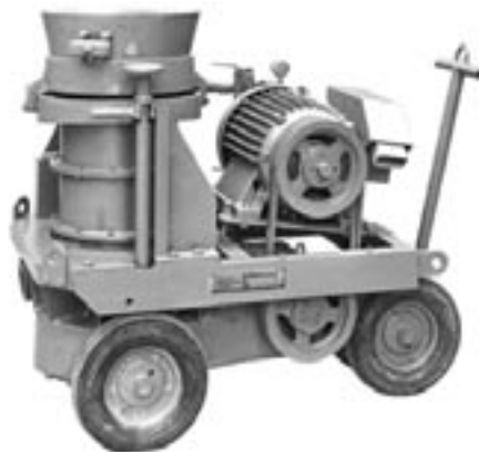
Meyco GM 57 rotor type machine