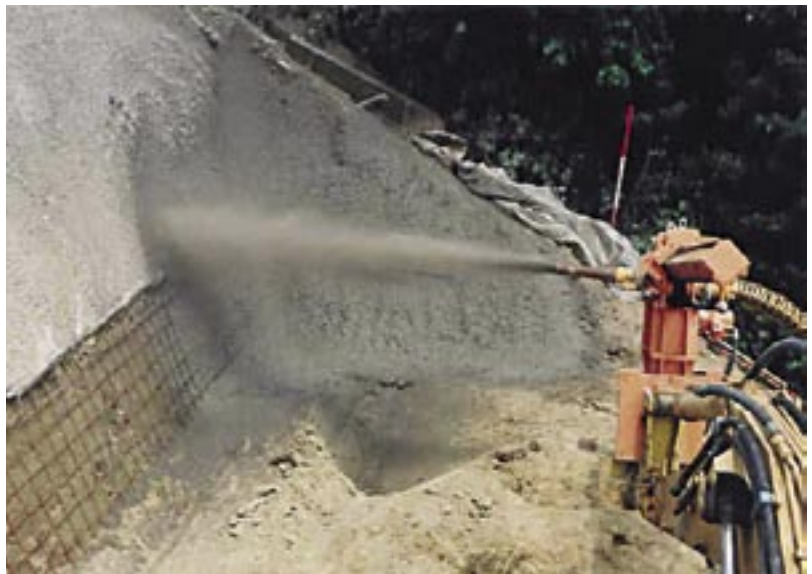
Automated wet shotcrete for a geotech application

and delivered to meet any need—site-batched, in a bag, or in a truck. Ironically, the success of wet-mix shotcrete has been achieved by combining modern material and equipment technologies with the patented basics of the original invention. Sound, well-graded materials combined as a concrete for placement at high velocity to achieve sufficient compaction to perform at levels above similar cast materials. And the neat thing is, you can place it upside-down if you like. Today, it is possible to achieve similar results in all phases of shotcrete construction with both wet- and dry-mix shotcrete methods. Properly understood, they are a screwdriver and a wrench. Which one is better? Depends on the task. What’s really important