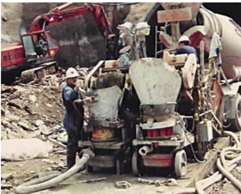
The introduction of the Rotary Gun in 1957 paved the way for large aggregate and high-volume shotcrete

The early years of large aggregate, high-output, dry-mix shotcrete set the pace for the soon-to-be-developed wet-mix method, especially in underground construction. Shotcrete was proving to be invaluable as a method for supporting rock and earth excavations in tunnel and mine construction. High volumes placed in many underground projects (50,000 yd 3 [38,000 m 3 ]) was common