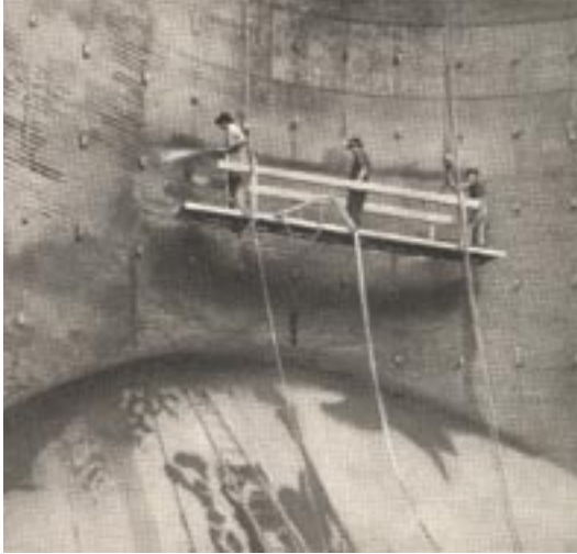
Restored, reinforced gunite flue at American Smelting and Refining Co., Helena, Montana, 1924

requirements, and only material placed by a genuine cement gun could be called gunite. The process crossed the Atlantic and the UK Cement Gun Company was founded. Successors to many of the early franchises still exist (in name) today, and the UK sprayed concrete (gunite) industry is alive and well, all born from the original Allentown activity.