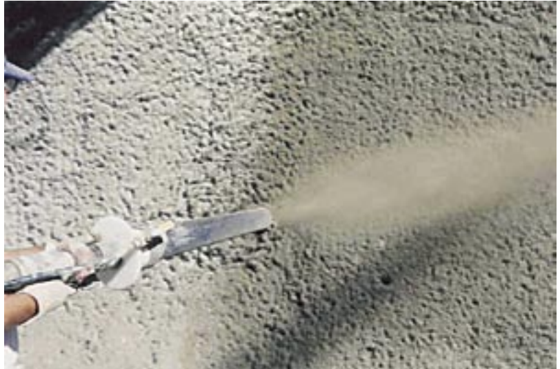
High-volume wet shotcrete with large aggregate is evident in the texture of the material already placed

Wet machines are available for projects ranging from “dental work” to high-production, heavy-construction applications. And the double tank is still produced. Mixtures can be designed, packaged,