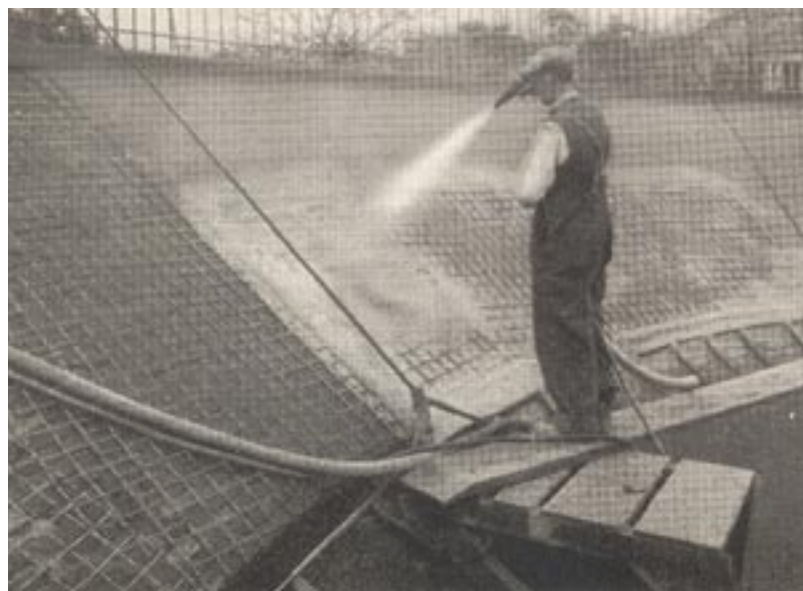
Nozzleman applying "gunite" for a water storage facility in Pittsburgh, 1919

The development of both the cement gun and the gunite process in Allentown was not coincidental.