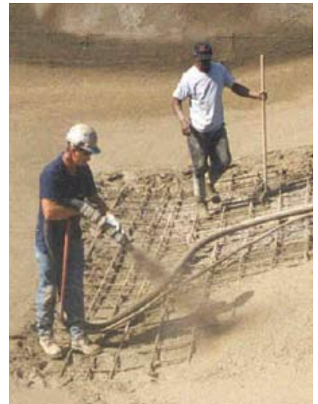
Fig. 9: Correct wet-mix nozzling placement on horizontal surface

minimizes body fatigue and gives the nozzleman more stability and control over the hose. ASA has created a high-quality shotcrete training program that includes a section on correct nozzling techniques. Most ACI certified nozzlemen listed on the website