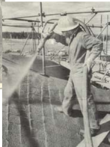
Fig. 3: Incorrect nozzling technique