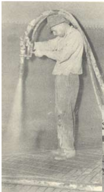
Fig. 2: Incorrect nozzling technique