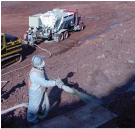
Fig. 7: Dry-mix vertical shotcrete