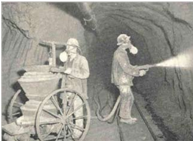
Fig. 1: Correct dry-shotcrete nozzling technique, 1916 (This photo is also found on the cover of Shotcrete, Winter 2003, V. 5, No. 1)

Some critics will argue that placing the hose between your legs is dangerous and unsafe. Some quote sections out of the OSHA Code book about high pressure hoses. The air pressure in the hose for the dry-mix shotcrete process is no more than what is registering on the air gauge (80 to 100 psi [0.55 to 0.69 MPa]). The forces experienced by the nozzle man for the dry-mix process come from the ft 3 /minute of air, not the psi pressure in the hose. In the wet-mix process, we deal with working pressure from the pump. Most wet-mix hoses are rated at 800 psi (5.5 MPa) working pressure. Without attaching an air nozzle at the end of the wet-mix hose, you would only have a concrete sausage being pumped out of it and experience very little force. The air nozzle attached to the end