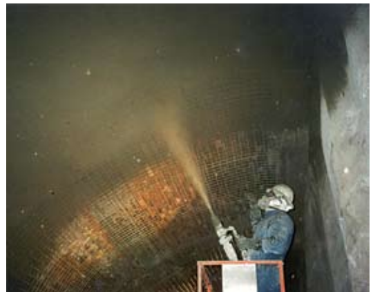
Fig. 6: Acme 2 in. (50 mm) nozzle/Staten Island Terminal Tunnel