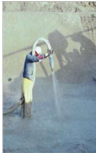
Fig. 8: Correct dry-mix nozzling placement on horizontal surface