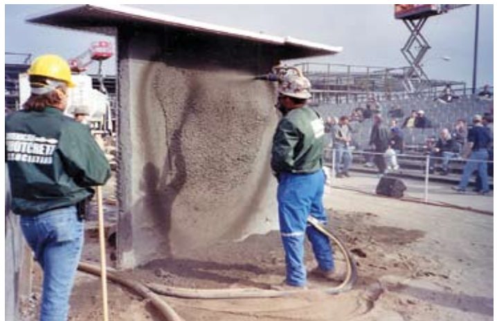
Fig. 5: Acme 1.5 in. (38 mm) nozzle/Las Vegas Mega Demo 2001